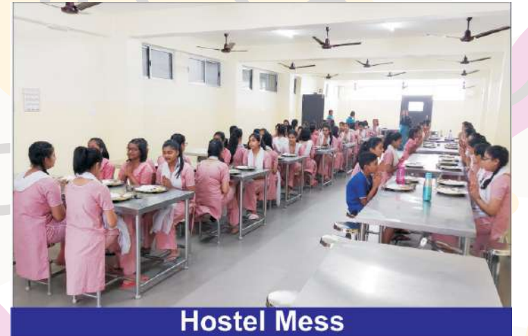
Separate Hostel for Girls