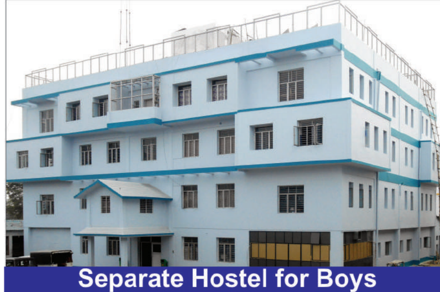
Separate Hostel for Boys