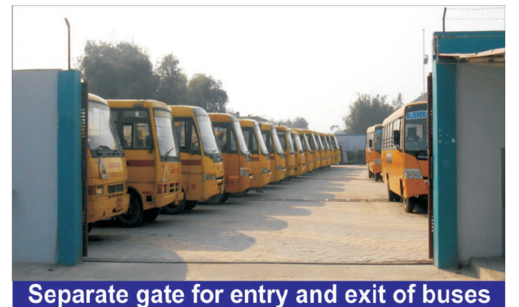
Separate gate for entry and exit of buses