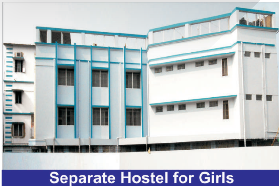
Separate Hostel for Girls